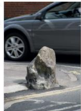
One of the stones on the junction of High Street and Fryemyng Lane/ Stock Lane, Ingatestone, August 2012

If you so wish, you can return to Ingatestone on a longer, more scenic route by turning left at the church, going through Buttsbury, over the Wash and turning right via Padhams Green Road and Hall Lane, past Ingatestone Hall and over the railway crossing back to the High Street at its SW end. You then simply turn right and back to the Market Place and your starting point.