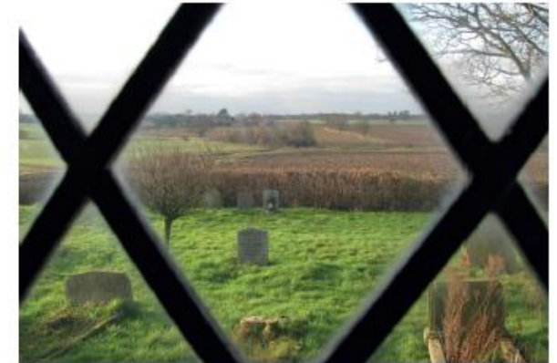
View from the tower window in Buttsbury Church towards Ingatestone, January 2013

When you reach the junction with Ingatestone Road again at the bottom of Honeypot Lane you now return the way you came to Buttsbury Church.