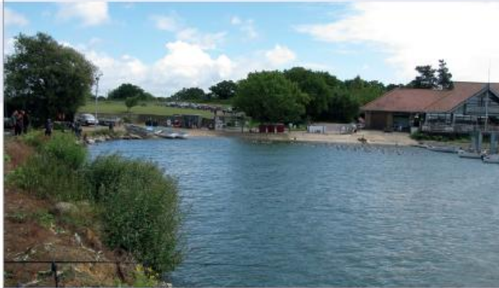
The Fishing Lodge and cafe at Hanningfield Reservoir from the groynes in Lodge Bay, June 2010

"These boys learnt to drive when they were about twelve, in someone's field or along the one straight road out by the reservoir". 4