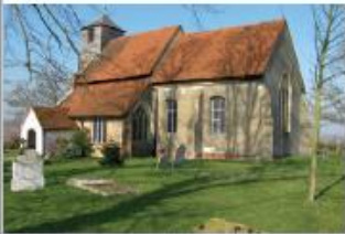
Buttsbury Church overlooking the Wid Valley, February 2013 1

Proceed out of the village, over the railway and past the Sewage Works on the right and over the old humped backed bridge that spans the River Wid and on up the hill to Buttsbury Church on your right.