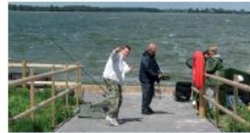
"Hanningfield-on-Sea" shows itself at an Essex youth fishing match, June 2010

Leaving the Fishing Lodge you proceed on to the turning on the left, Middlemead, which takes the road along the main NE dam end of the reservoir, past the water works and up into West Hanningfield village. This is the furthest point in the ride from Ingatestone.